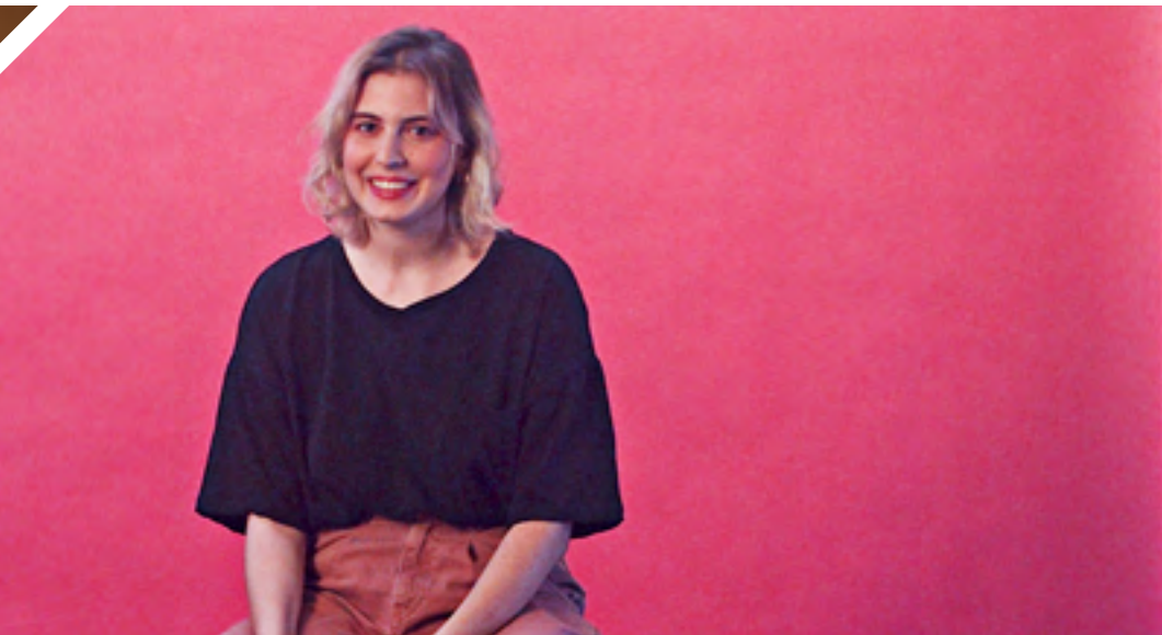
GENDERNET: SEX IN THE AGE OF THE INTERNET