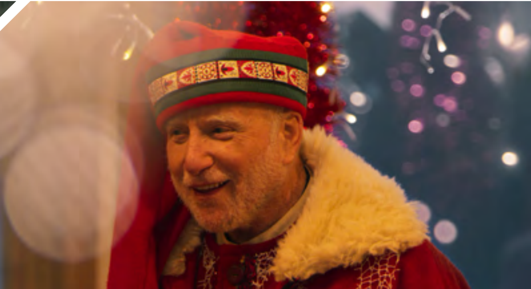
AIUTO! È NATALE!