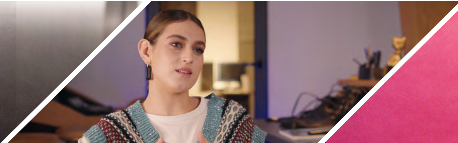
WONDERKIDS: FROM SCHOOL DESKS TO THE CHARTS