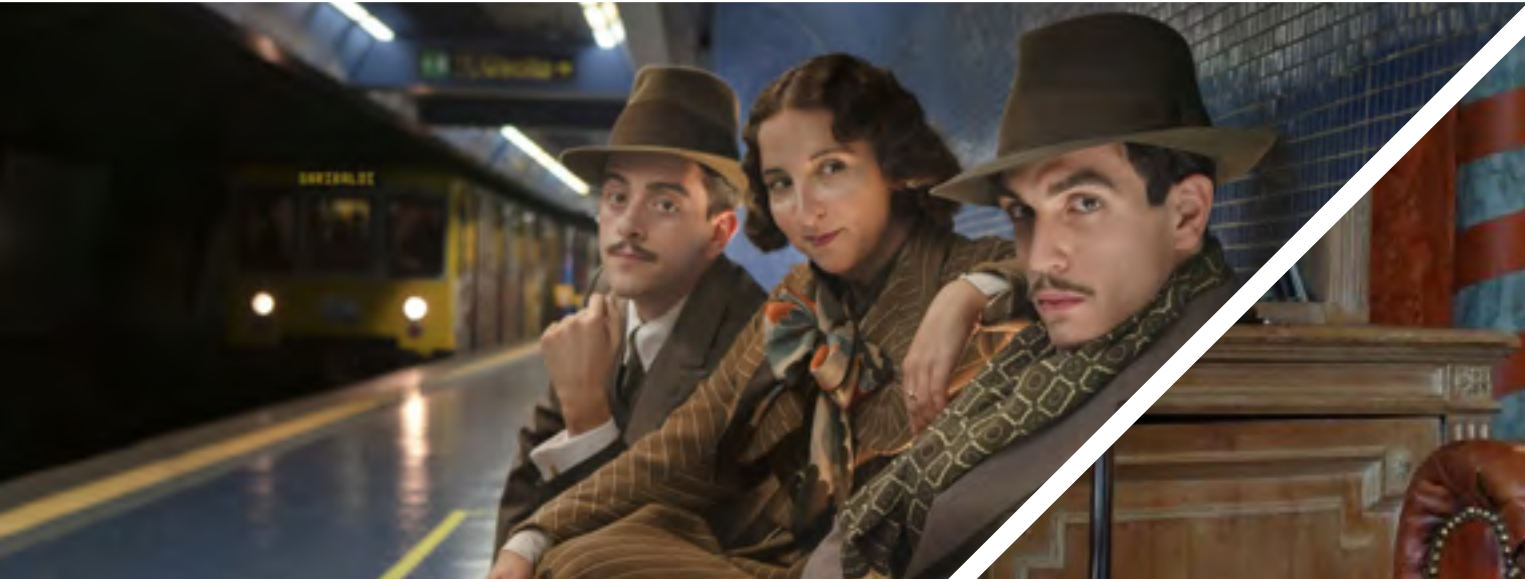
I FRATELLI DE FILIPPO