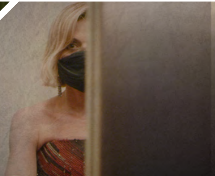
THE LION’ S COURAGE