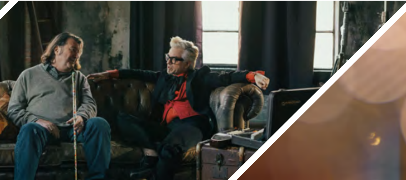
FRANCO BATTIATO - LA VOCE DEL PADRONE