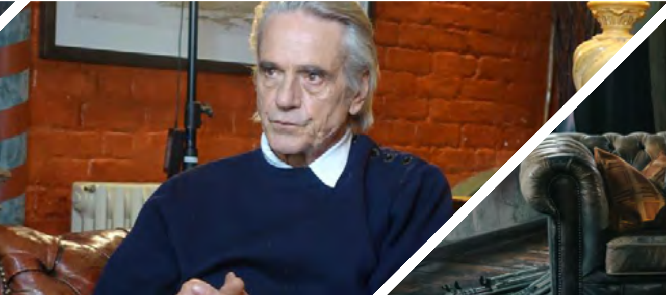
FRANCO ZEFFIRELLI, CONFORMISTA RIBELLE