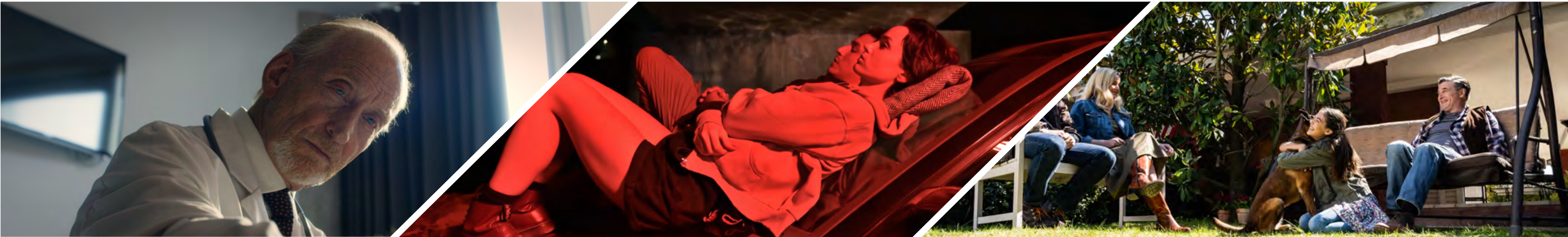
THE BOOK OF VISION